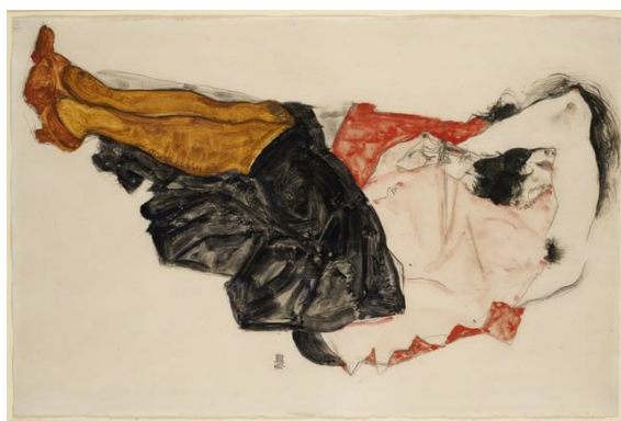
Egon Schiele, Woman Hiding Her Face (1912)